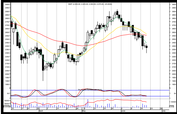
INDF TRADING BUY