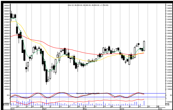
AALI TRADING BUY

Saham ini masih berada pada area konsolidasi dengan range 13400 – 14350. Melemahnya harga pada perdagangan kemarin masih memungkinkan terjadinya pelemahan kembali sampai dengan support 13450. Namun bila terdapat sentimen positif yang menyebabkan harga menguat dan menembus level resistance maka target terdekat 14350.