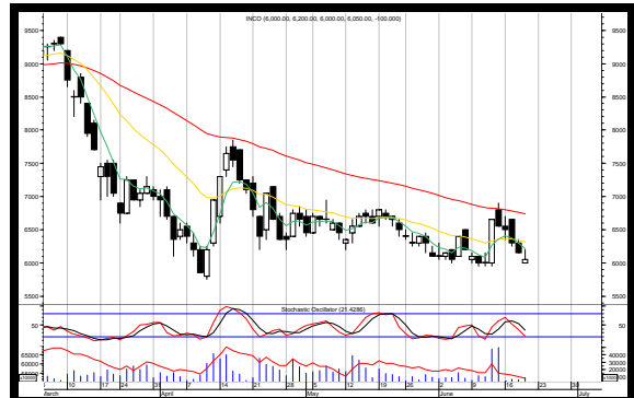
INCO TRADING BUY

Penguatan harga pada perdagangan hari ini masih memungkinkan untuk terjadinya penguatan kembali dengan target terdekat 28550. Namun beberapa indikator TA yang telah berkategori overbought memungkinkan terjadinya pelemahan pada perdagangan hari ini dengan support 27100.